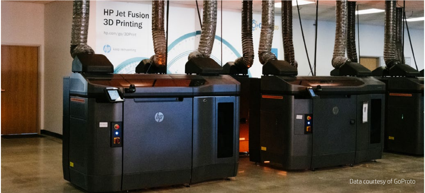
Data courtesy of GoProto

As an HP DMN partner, GoProto assists Ropes Edge in producing a new safety device to protect life-supporting ropes from damage on sharp edges.