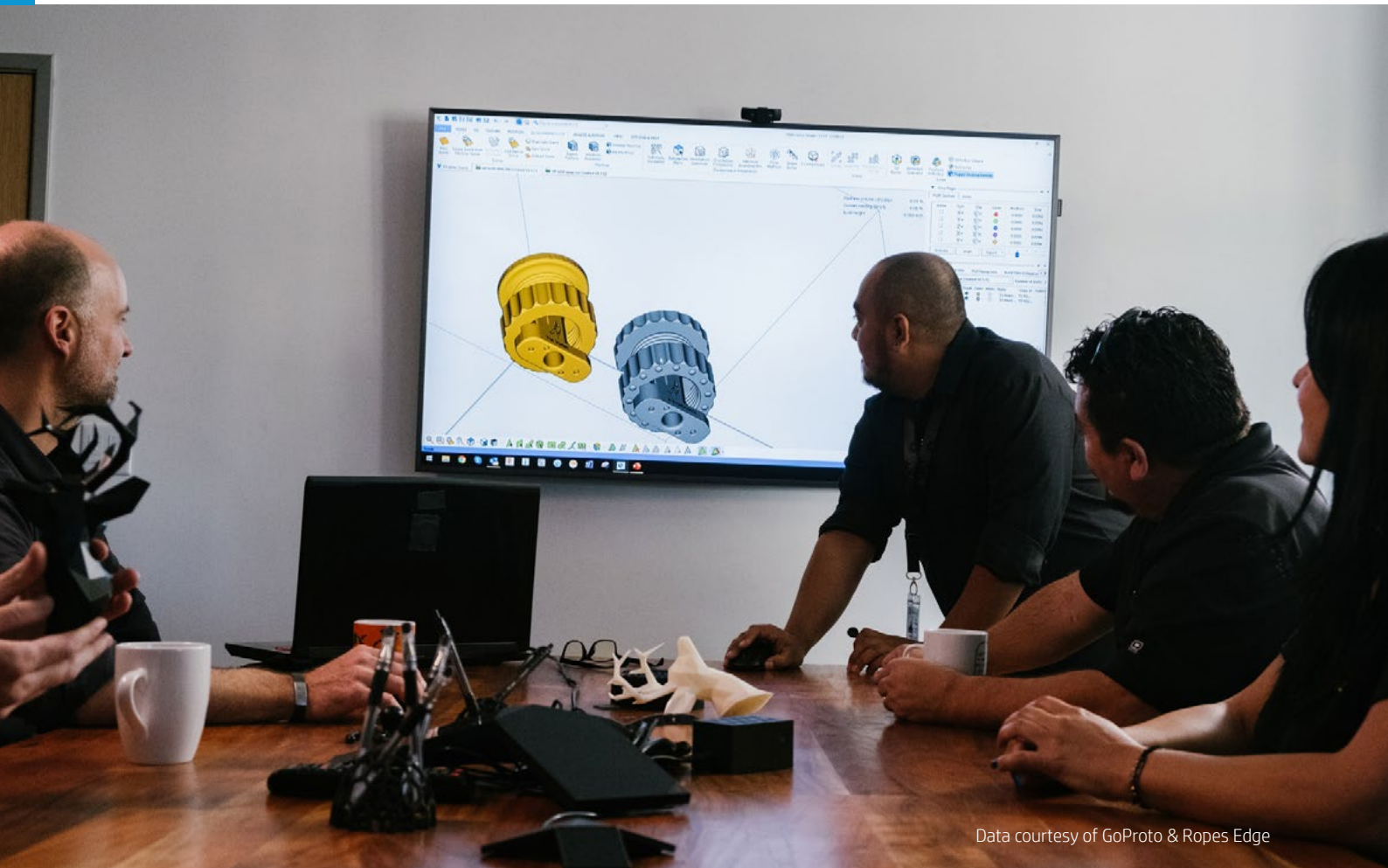
Data courtesy of GoProto & Ropes Edge