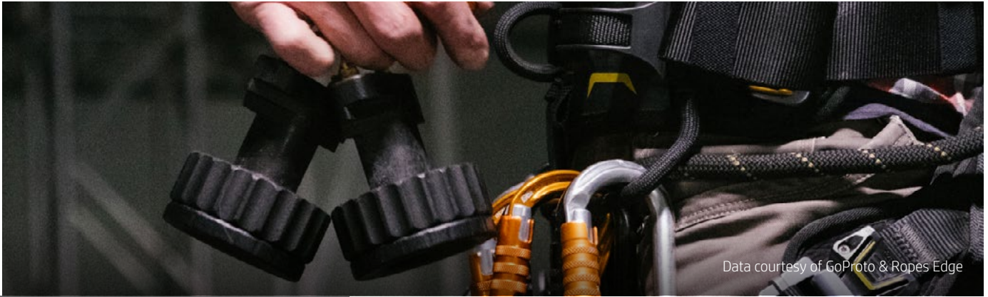
Data courtesy of GoProto & Ropes Edge